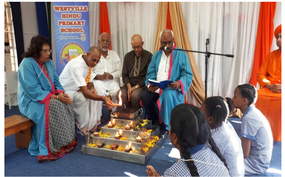
Arya Samaj South Africa taking part in the Durban Diwali festival that was hosted by South African Hindu Maha Sabha