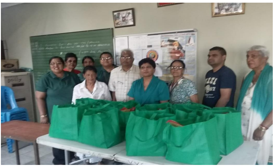
Vedic Yuvak Sabha preparing hampers for Diwali to be distributed to needy families