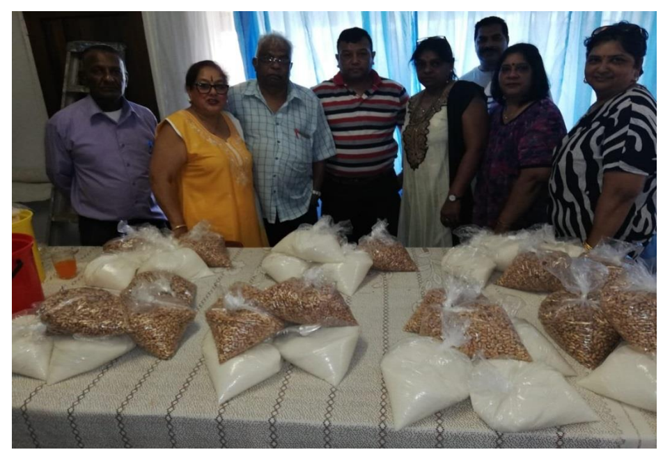
Executive members from the Pietermaritzburg affiliates preparing Diwali hampers