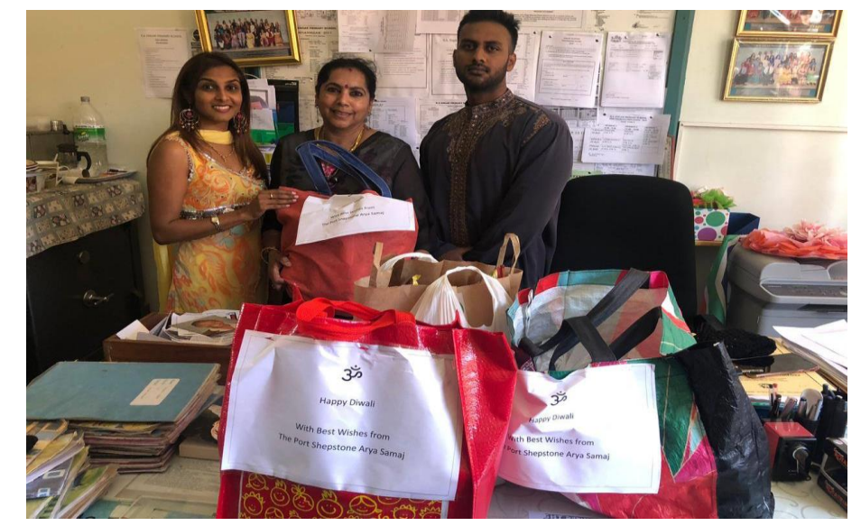
Members from Port Shepstone Arya Samaj handing out Diwali Hampers