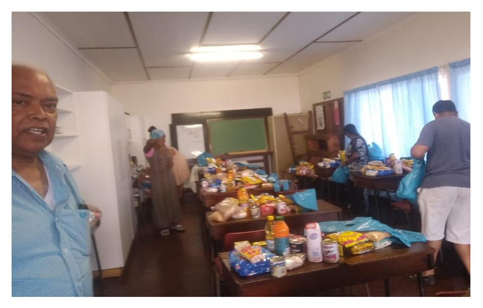
VDS Pietermaritzburg distributed 20 hampers to indigent families