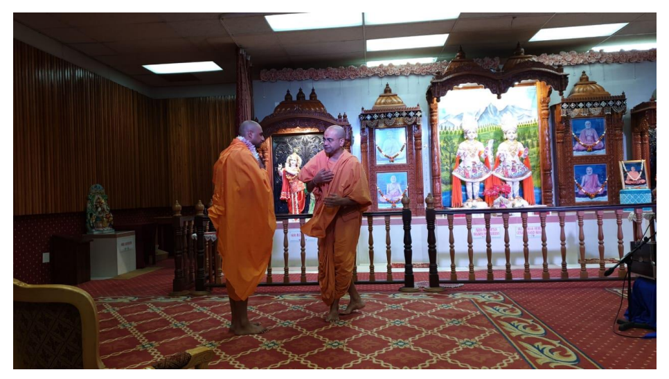
Swamiji an invited guest at Swaminarayan Mandir in Durban