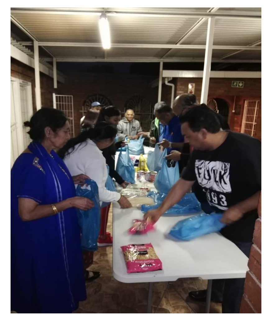
Members from Plessierlaer Arya Samaj packing hampers for distribution