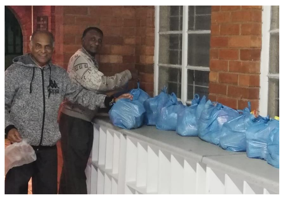
Plessierlaer Arya Samaj packing hampers for distribution