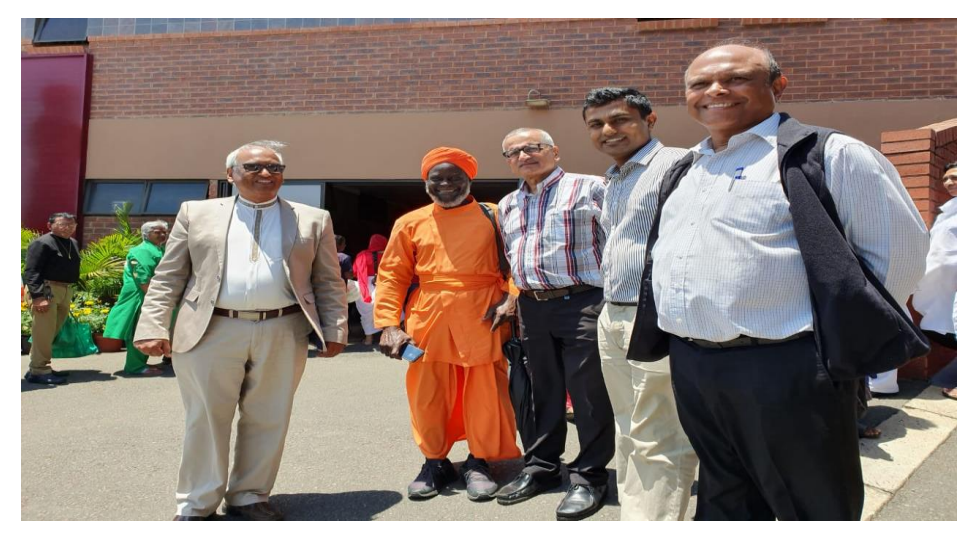
APS Officials with Swamiji from Ananda Marga mission