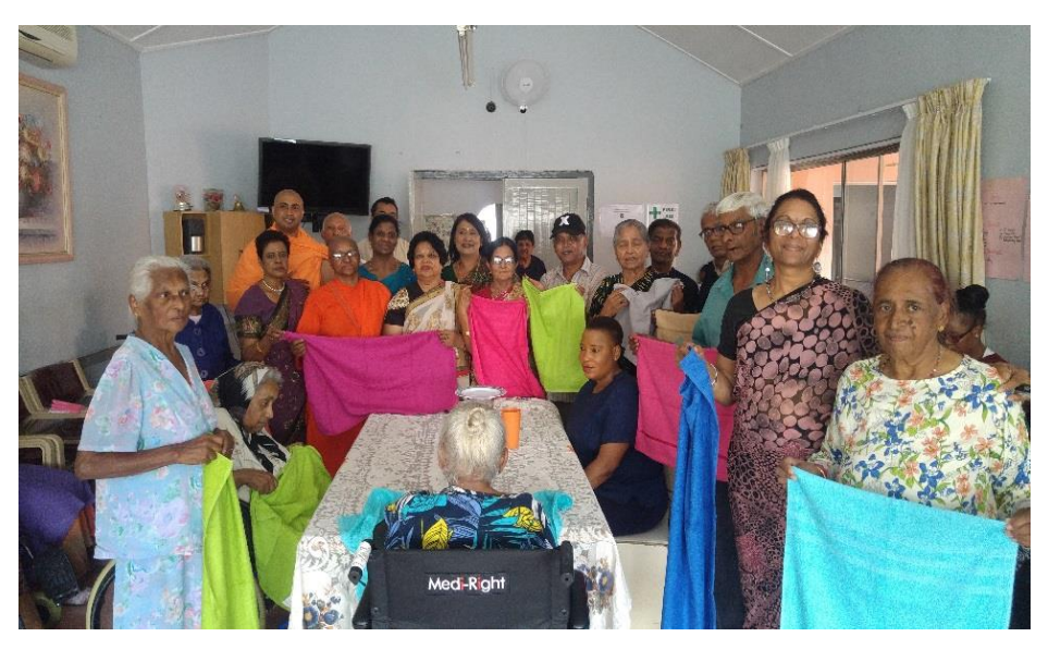
Members from the Arya Senior Citizens donating towels to ABH - PMB