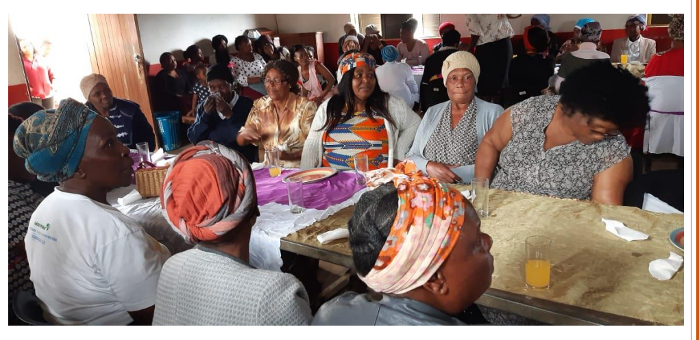
Veda Dharma Sabha Verulam donating food to 75 senior citizens of the Alwanduthando Service Centre