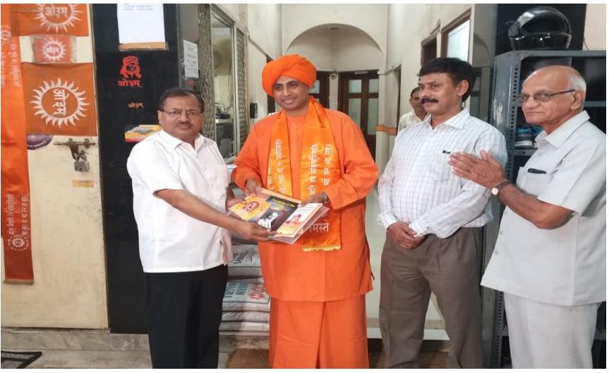
Swamiji on his visit to the Delhi Arya Samaj