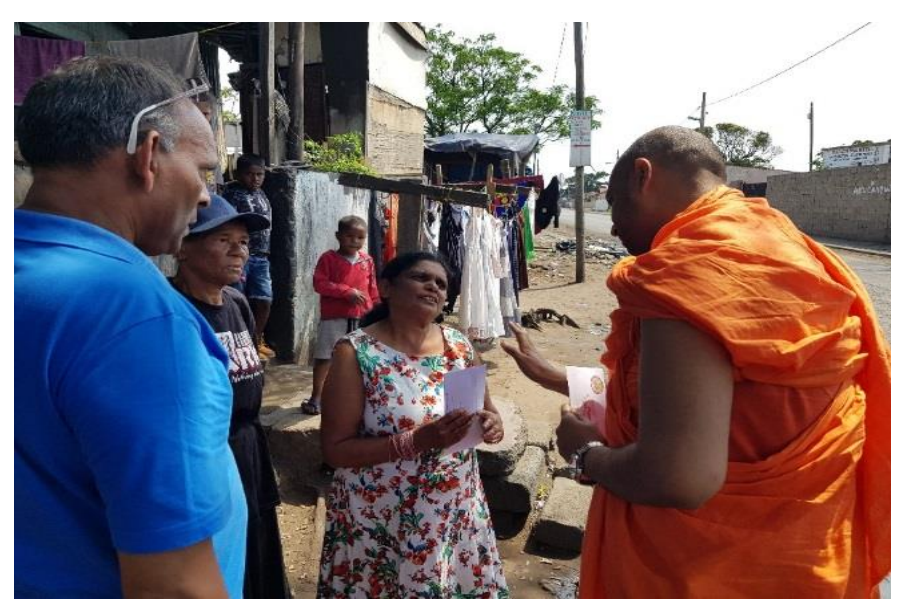
Donor sponsored donation handed out by Swamiji to women in need