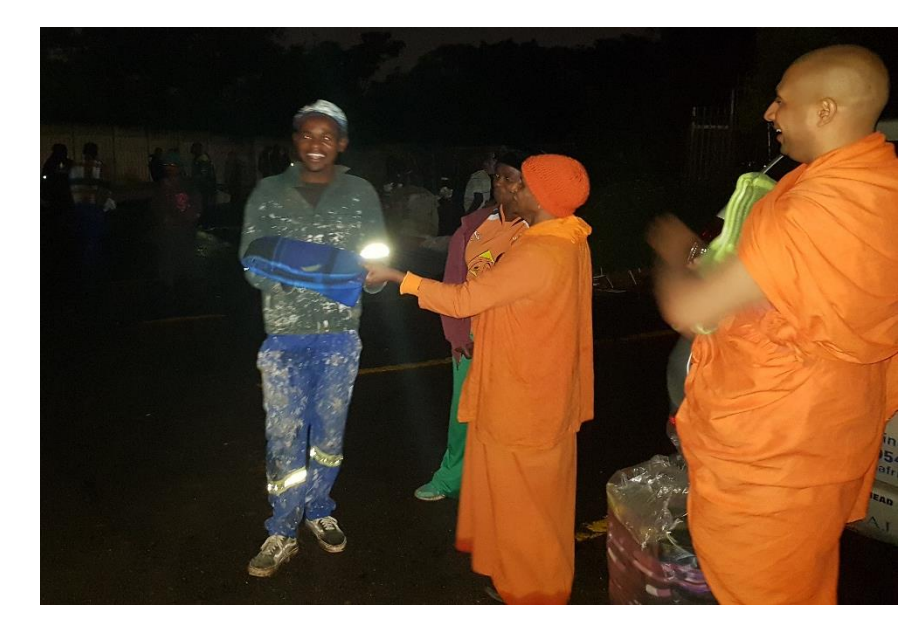
Disaster Relief for those affected in Kenville with the distribution of blankets from the Samaj