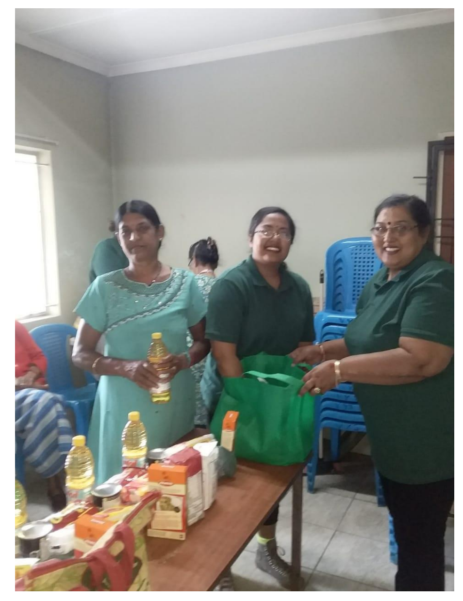
Vedic Yuvak Sabha preparing hampers for Diwali to be distributed to needy families