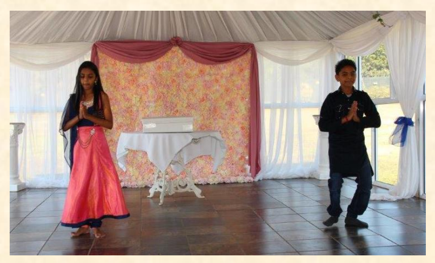
The youth performing a dance item