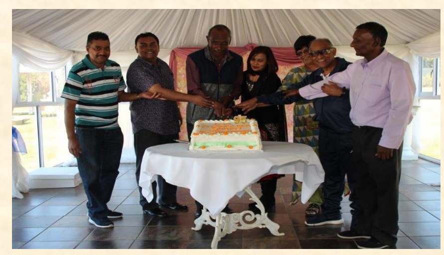
Members cutting the cake to mark the 95th anniversary