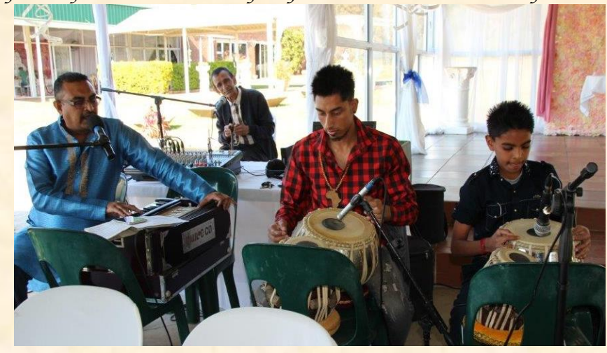
Members celebrating with song and dance

Congratulations to Plessierlaer Arya Samaj and all its members for continuing the sterling work of the Samaj. Celebrating 95 years of existence is truly a special achievement. May the Samaj grow from strength to strength!