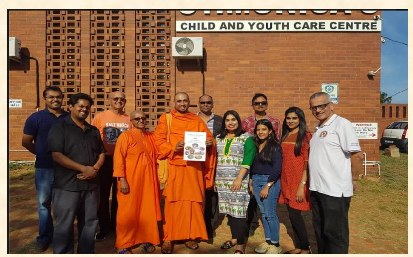
Arya Samaj officials at St Monica's Child and Youth Care Centre