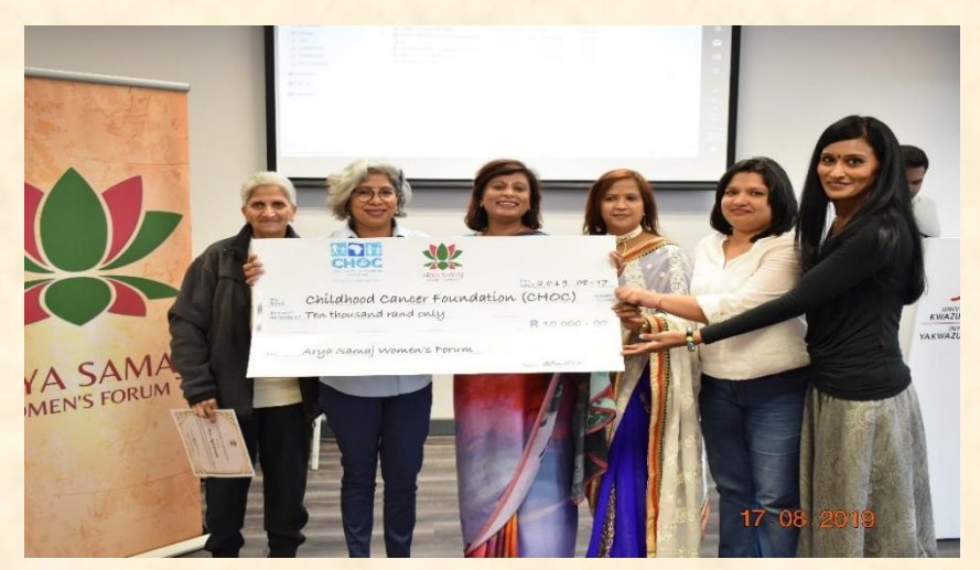
Donation of R10 000 from the women's forum to the Choc foundation