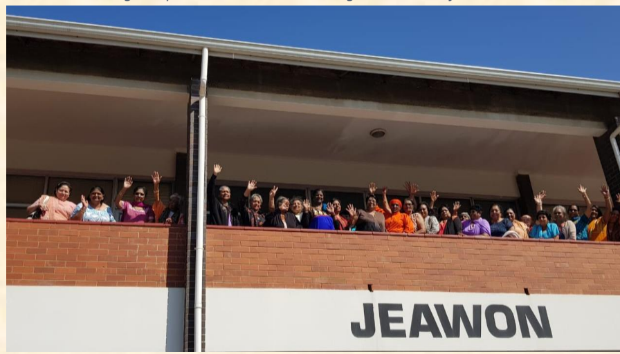
Perfect photo opportunity moment for all!