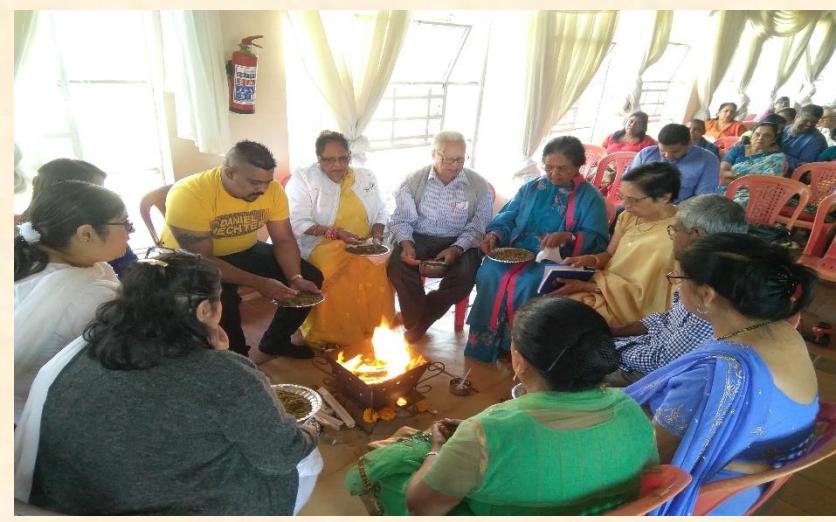
Members of the public performing havan in their own groups