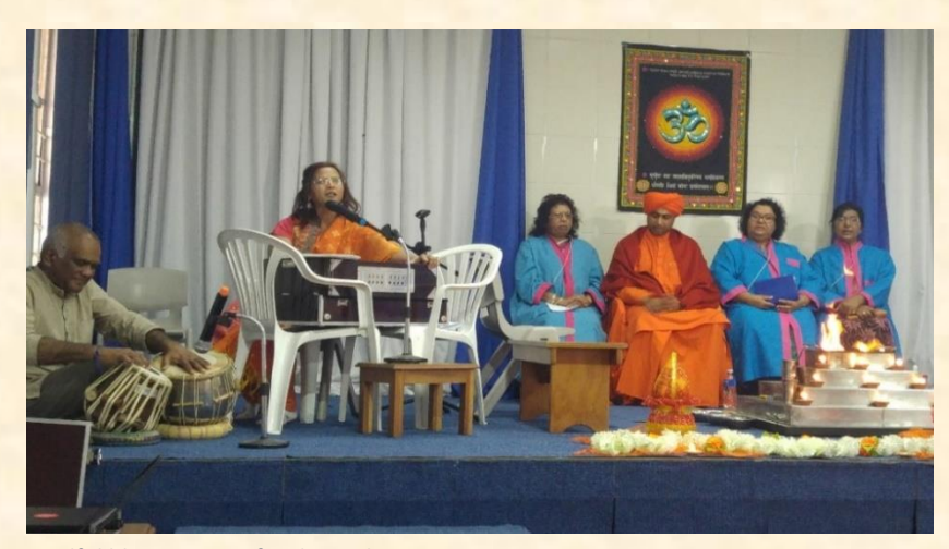
Soulful bhajans sung for the audience