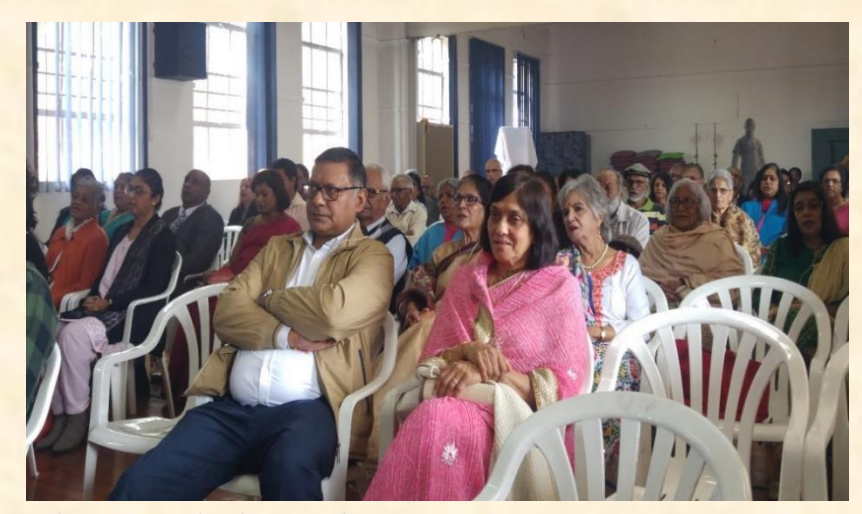
Audience engaged in the proceeding occuring on stage