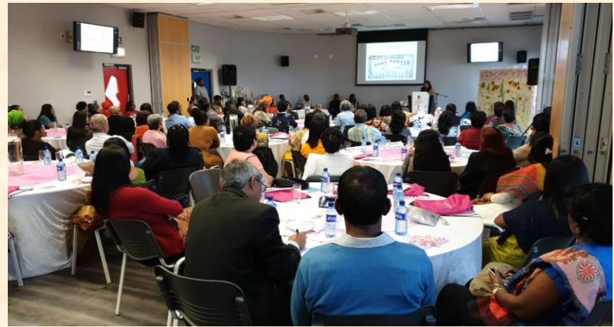
Members engrossed in the in-depth talks delivered on stage

The Women's forum hosted a programme with speakers from all spheres relating to Cancer Treatment, Cancer Awareness and Cancer support programmes. All the proceeds from the event, totalling to an amount of R10 000, was donated to CHOC (Childhood Cancer Foundation). The function was well organised, and we are sure that not only the funds raised but the information provided will go a long way in creating awareness of the dangers of cancer.