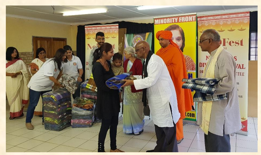
Blankets were handed out to the residents