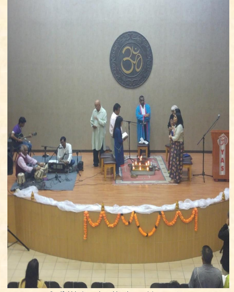
Soulful bhajans played by the musicians on stage.