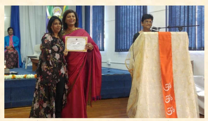
Participants from the business masterclass being awarded their certificates