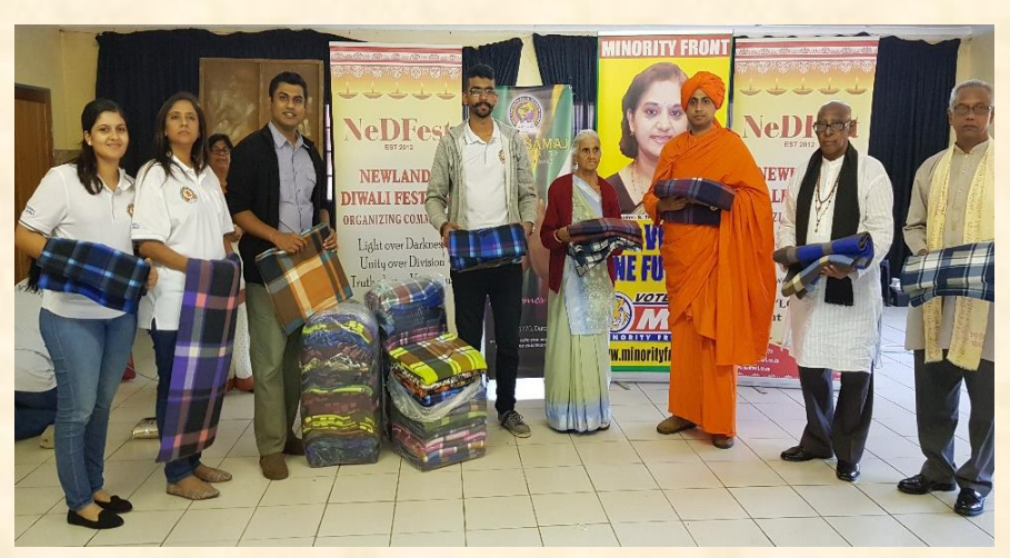
Officials of the Arya Prathinidhi Sabha