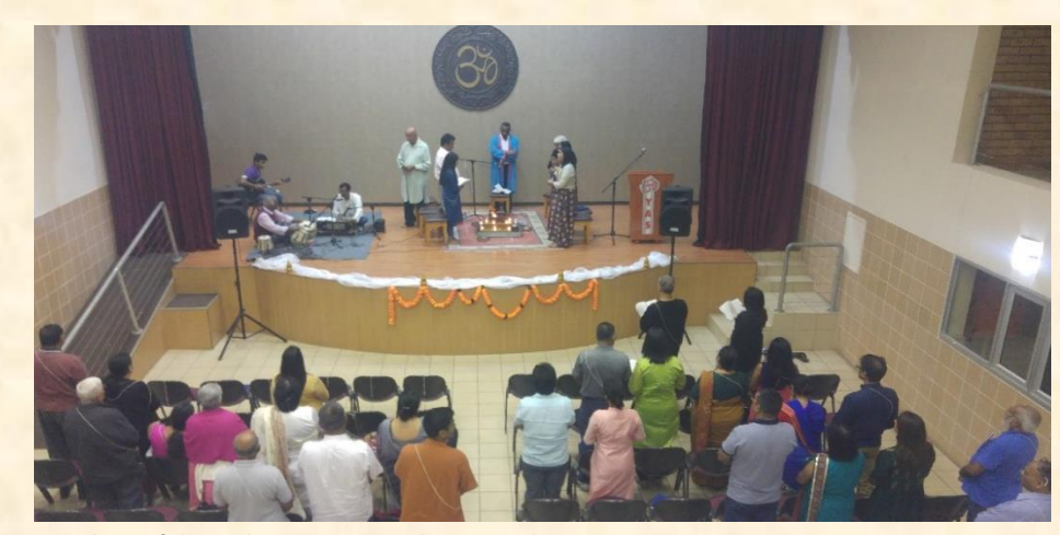
Members of the audience enjoying the proceedings