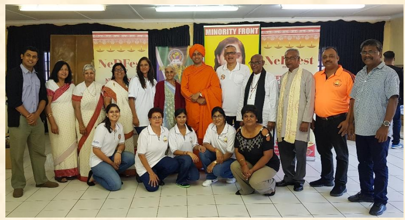
Members of Nedfest and the Samaj

NeDFest in association with the Arya Prathinidhi Sabha of South Africa hosted an early Diwali Treat for the residents of Happy Valley in Stanger. The plight of the people in the area is a cause for concern. The event provided some relief in their lives - blankets, food and clothes were provided for all.