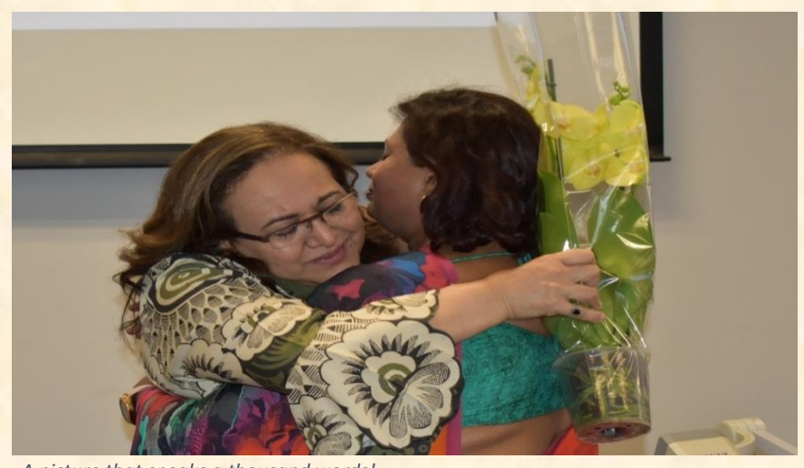
A picture that speaks a thousand words!