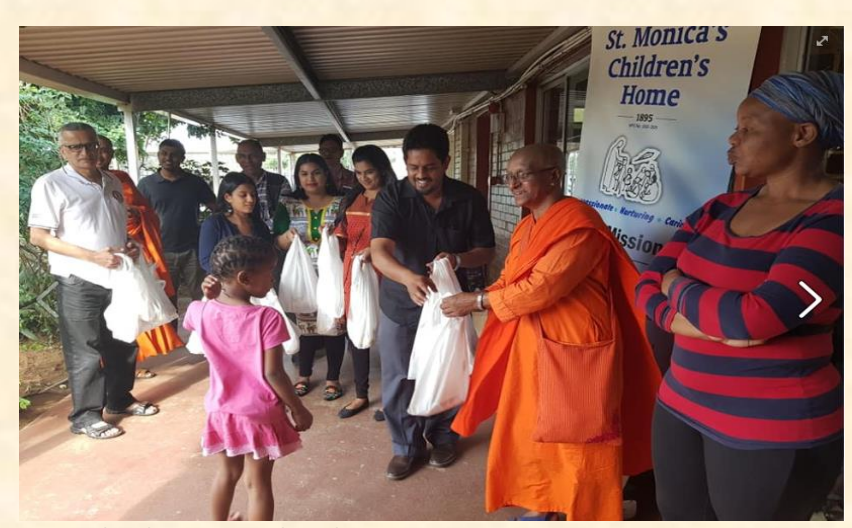
Swamiji handing out parcels to the young