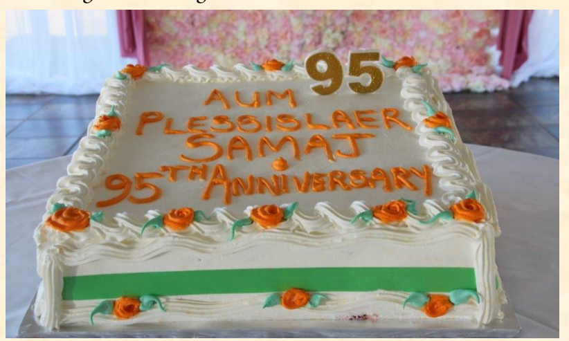
A beautifully designed cake to mark the occasion