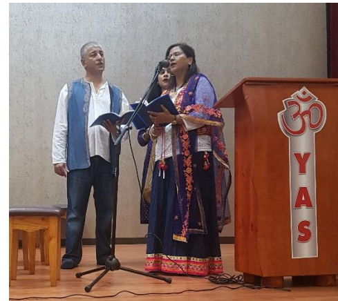
Vaidik Dharam Ki Jay being sung by members