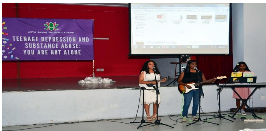
Women rock band playing music for the crowd