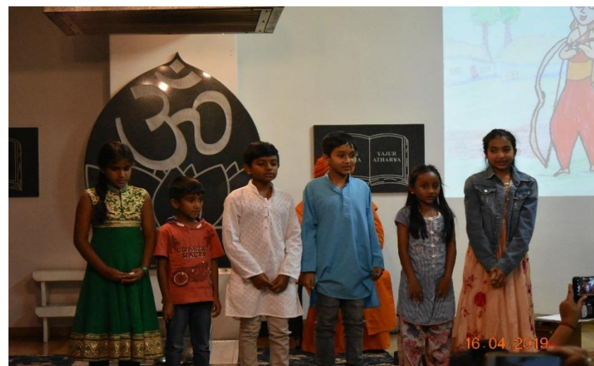
Children singing melodious songs for the audience