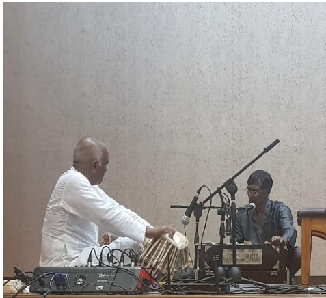
Beautiful Bhajans being rendered for all to enjoy