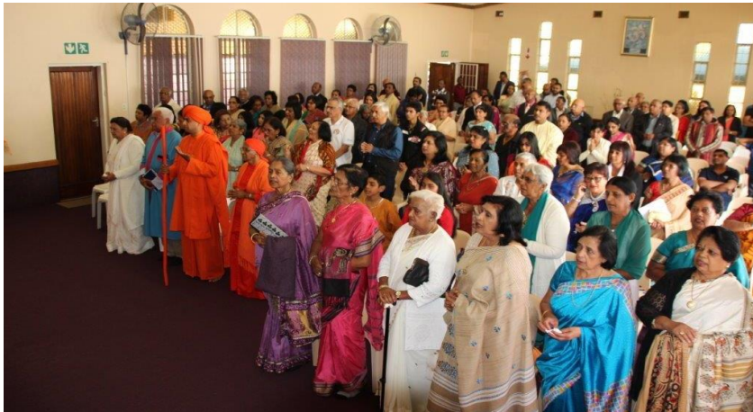
All in attendance enjoying the event at Plessislaer Arya Samaj