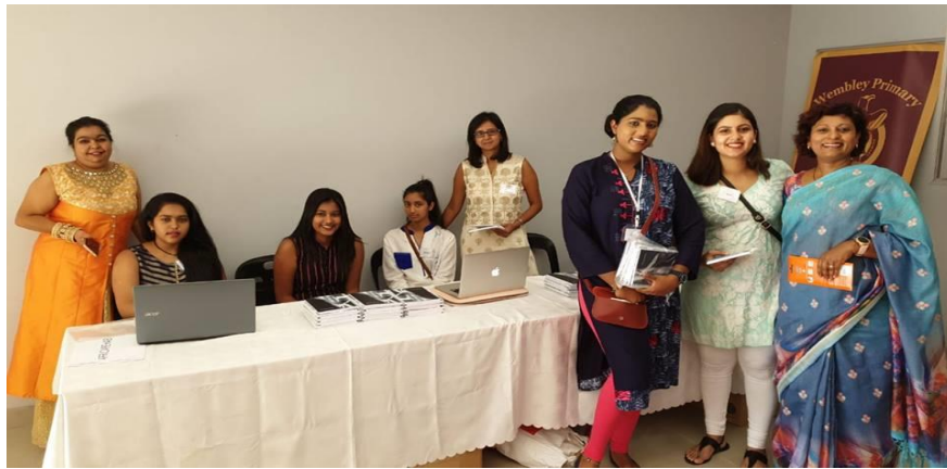
Women Power in full display!! The members of the organising committee

The Arya Samaj Women's Forum hosted its inaugural function and a brilliant one at that. Realising the key issues affecting our youth today the women's forum decided to tackle the issue head on by raising awareness of the hidden yet silent killers of depression and substance abuse. All in attendance will surely agree that the program was well structured and full of valuable information. The key message for all to remember "You are not alone."