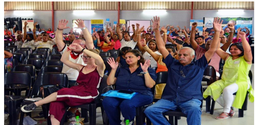
Audience fully engaged and part of the interactive session