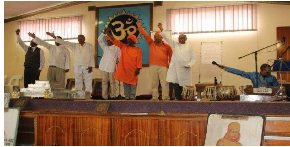
Theatrical play performed by the members of the Samaj